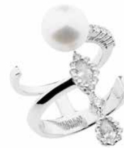
Yeprem | @yeprem