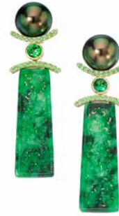
Assael | @assaelpearls