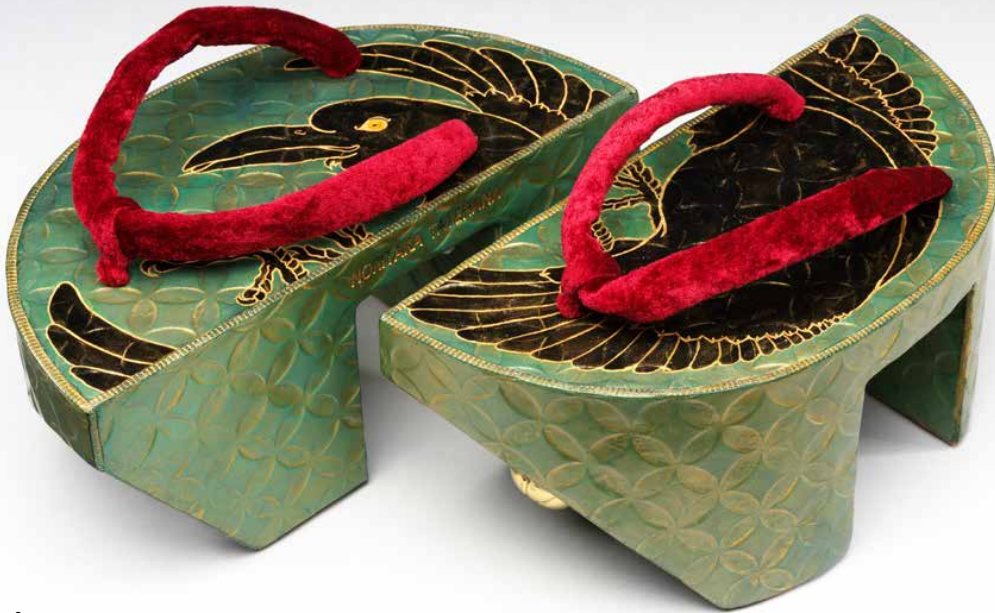
2. Credits: 1. Kimono, detail. Japan, early 19th century © Victoria and Albert Museum, London | 2. Raven geta, by Noritaka Tatehana. Tokyo, Japan, 2009 - © Victoria and Albert Museum, London