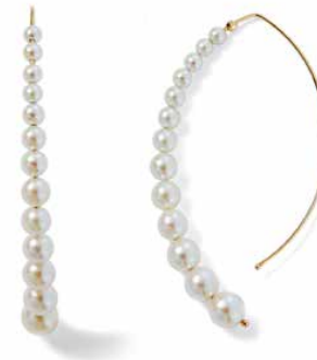
Mizuki | @mizukijewels