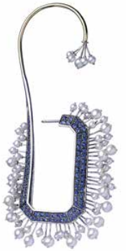
EËRA | @eera

MINIMAL | MODERN ELEGANCE | ROUND PEARLS | CLEAN DESIGN | UNUSUAL SHAPES