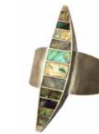
Parts of Four